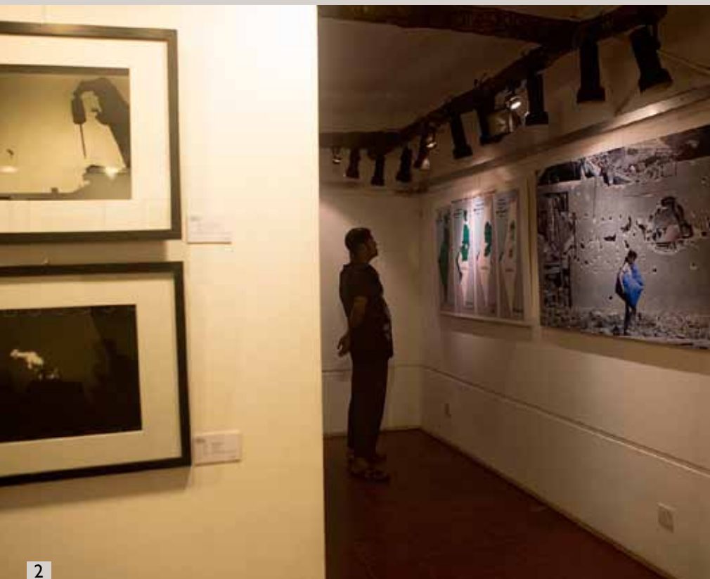
2. The depiction of Palestine losing its land to Israel, caught attention of a visitor.